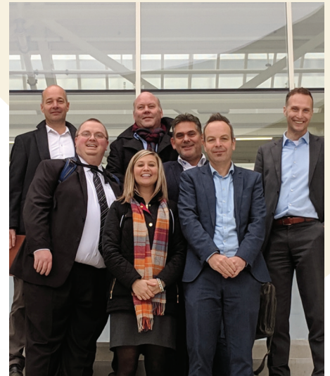
FALL TRIP TO EUROPE

In the Spring of 2018, GROW Licking County CIC's Executive Director and a member of the Board of Directors traveled to Düsseldorf and Hannover Germany to attend two of the premier manufacturing trade shows in the world. The Düsseldorf Tube and Pipe show highlights many of the world's leaders in construction equipment manufacturing as well as various pipe manufacturers and suppliers. The Hannover Messe show is considered the world's premier manufacturing show where attendees can explore emerging technology within the manufacturing space.