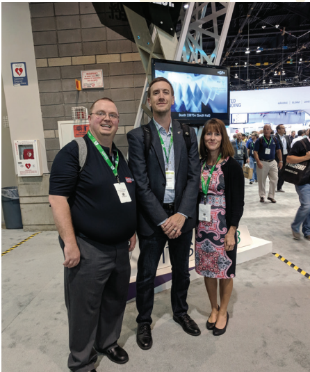
IMTS SHOW - CHICAGO, IL

GROW Licking County CIC traveled to Chicago (IL) in the fall of 2018 to attend the IMTS show, one of the largest manufacturing and technology trade shows in North America. We met with numerous domestic and international firms interested in locating or expanding their operations in the Midwest/Ohio marketplace.