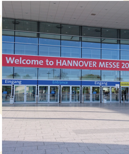
TRADE SHOWS IN GERMANY

GROW Licking County CIC traveled to Chicago (IL) in the fall of 2018 to attend the IMTS show, one of the largest manufacturing and technology trade shows in North America. We met with numerous domestic and international firms interested in locating or expanding their operations in the Midwest/Ohio marketplace.